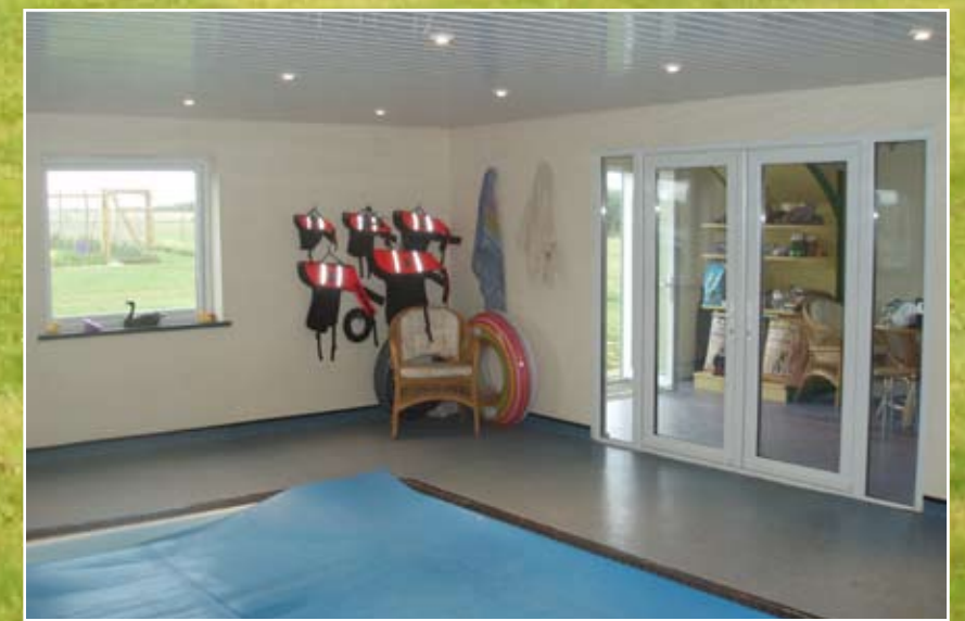
CANINE COUNTRY CLUB